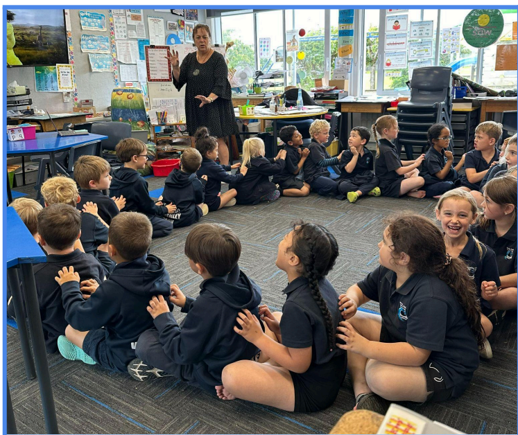
Room 7 - circle massaging to relax and unwind after a busy day.

Please note that we will not be adding (or removing names) to/from the list of kids getting school lunches until our new permanent provider is in place (hopefully by the end of the term). The system is stressed enough in the current circumstances, without us changing the numbers of meals being ordered from day to day - thanks for your understanding.